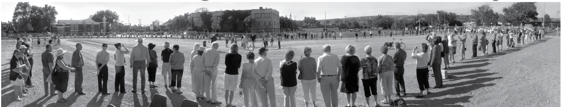
Groundbreaking attendees outline the footprint of the NEW Parmly Billings Library.

One Book Billings is back! Pick up a book for the September One Book Billings discussions that take place the week of September 10 all around the Billings area. The first book is Ride the Jawbone by Jim Moore . Set in central Montana, a young lawyer must defend a horrible man accused of a dreadful crime. This legal drama is wrapped around the history of a developing land and the conflicts between ranches, railroads and remarkable characters.