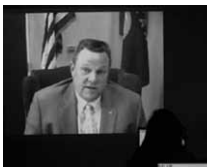
Senator Jon Tester hosting the dedication of the new Computer Classroom.

On April 13, we dedicated a new computer classroom and teleconference center , the Library's latest community service. Our first teleconference was hosted by Senator Jon Tester , brought to us via Skype from Washington, DC. He thanked the community and, in particular, the donors who so generously support the Library Foundation.