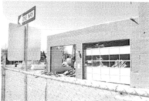
Back of the Parmly Billings Library, March 28, 2014