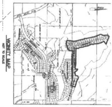
LOCALITY MAP NOT TO SCALE